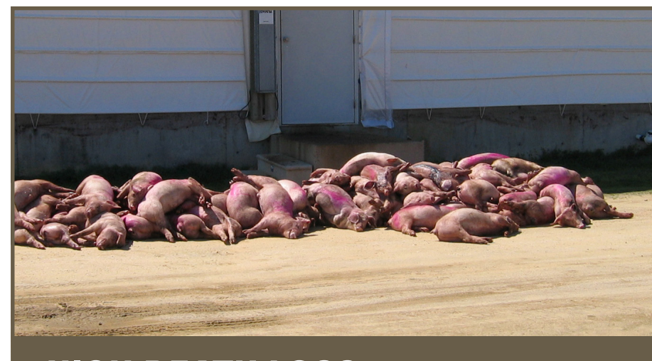
HIGH DEATH LOSS